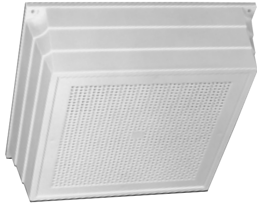
Model FC8W Model ST4-FC8W Model STD4-FC8W