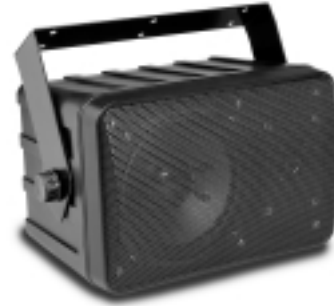
AXCA537B RAINPROOF CONSTRUCTION

Extended frequency response, high power capability and rainproof construction. Ideal main speakers for a foreground quality music system. 40 watts peak into 8 ohms or 30 watts at 70 V line input. Use indoors or outside in less protected installations. Fiber reinforced, UV resistant, high impact ABS plastic enclosure with stainless steel fasteners and brass mounting inserts. Rainproof 5-1/4" LF driver has a filled polypropylene cone and sealed rim. Rainproof 1" HF driver has a mylar diaphragm. Recessed knob switch to select 8 ohms input or 70 V line input. Standard color: black. Shipping weight: 8 lbs.